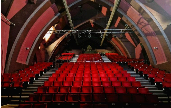
Auditorium – 293 seats