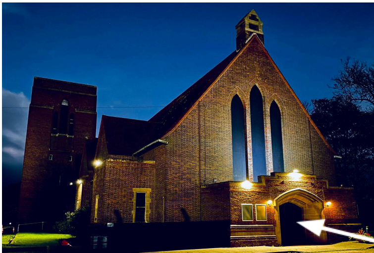
Main entrance doors

The Tower Theatre is a theatre in Folkestone, Kent that has been converted from a former Garrison Church of Shorncliffe Camp Barracks.