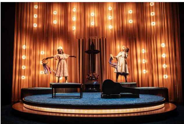
Marie and Rosetta

The Rose auditorium is an open space, with 763 seats and a wide stage with no proscenium arch. The grid extends over the stage and auditorium at some 9m high. with three levels. There is a workshop onsite with basic making facilities for stage and maintenance areas for LX and sound. The lighting rig consists of 30 Martin Viper XiPs with generic fixtures alongside.