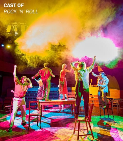
CAST OF ROCK 'N' ROLL EMILIA FOX & THEO JAMES SEX WITH STRANGERS